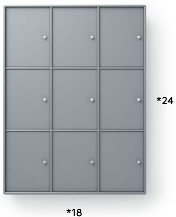
H 138.8 cm / W 104.6 cm / D 38.8 or 47.6 cm 9 rooms