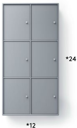
H 138.8 cm / W 70.4 cm / D 38.8 or 47.6 cm 6 rooms