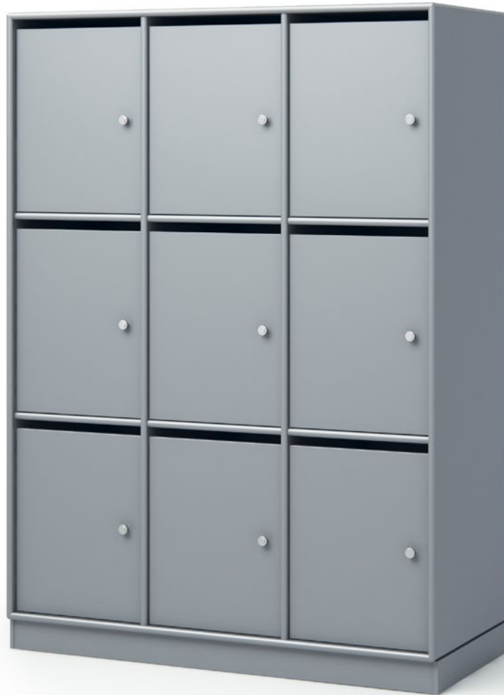
9 doors locker on 7 cm plinth with mail slot Colour: Graphic