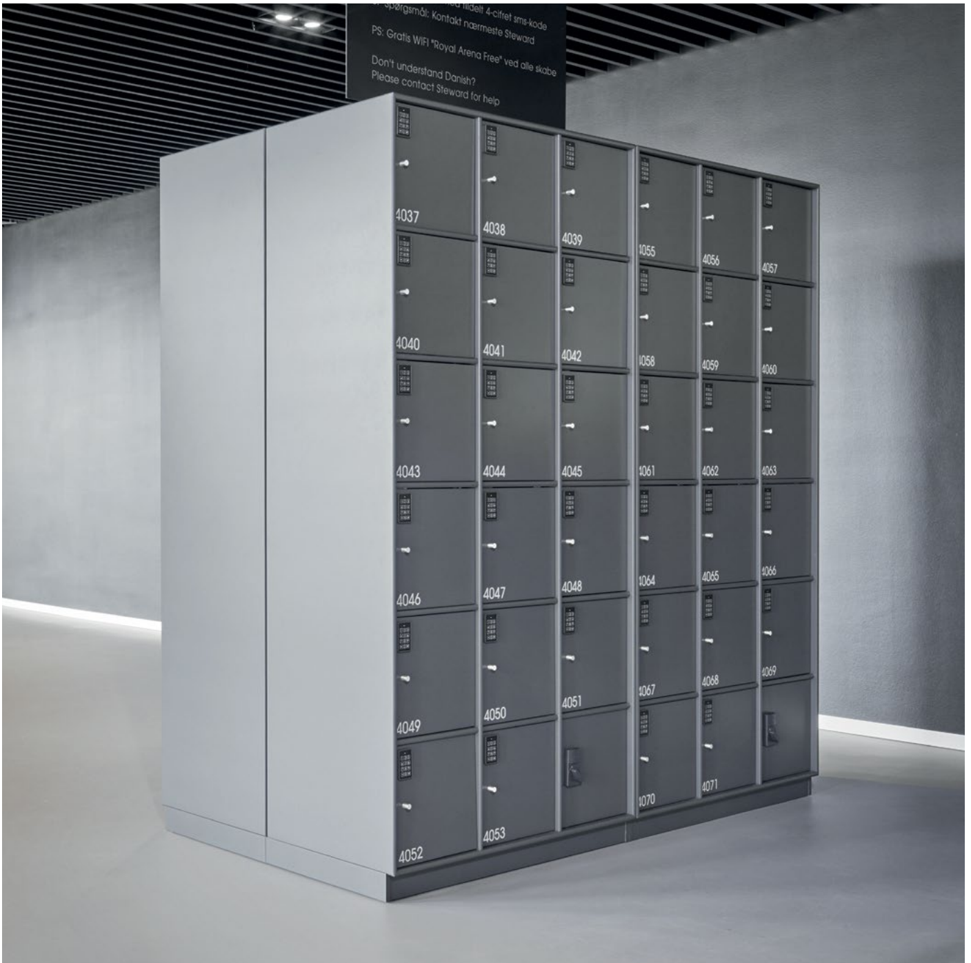
Royal Arena - Copenhagen 2017 Colour: Anthracite