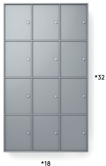
H 184.4 cm / W 104.6 cm / D 38.8 or 47.6 cm 12 rooms