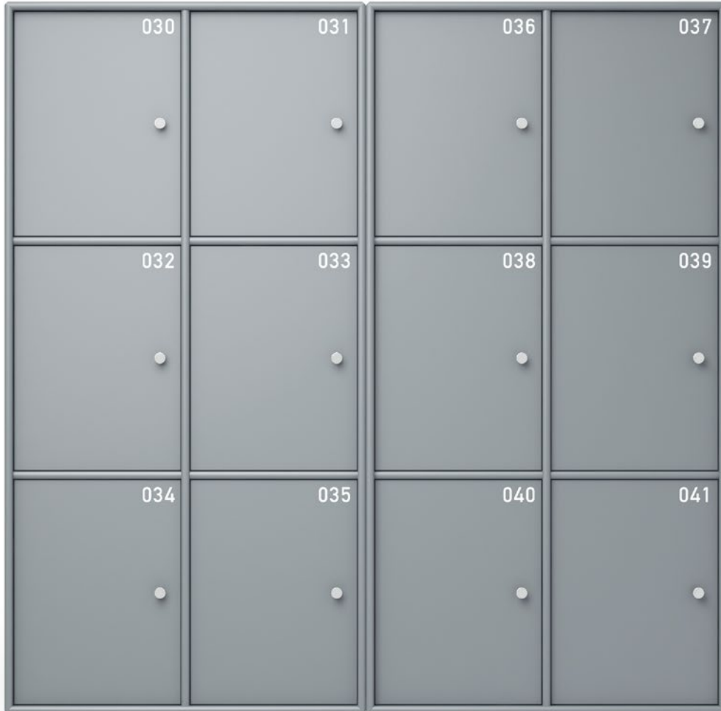
2 x 6 door lockers with numbers and key card lock Colour: Graphic