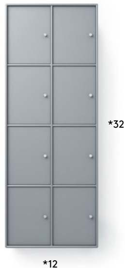
H 184.4 cm / W 70.4 cm / D 38.8 or 47.6 cm 8 rooms