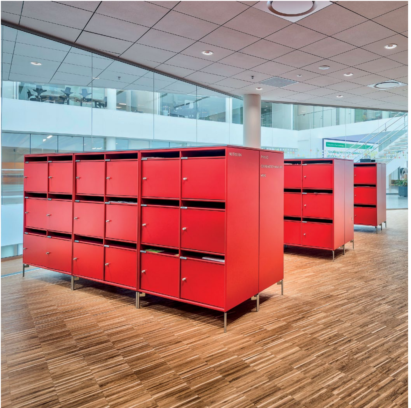
Arla Innovation Center - Aarhus, Denmark 2017 Colour: China Red