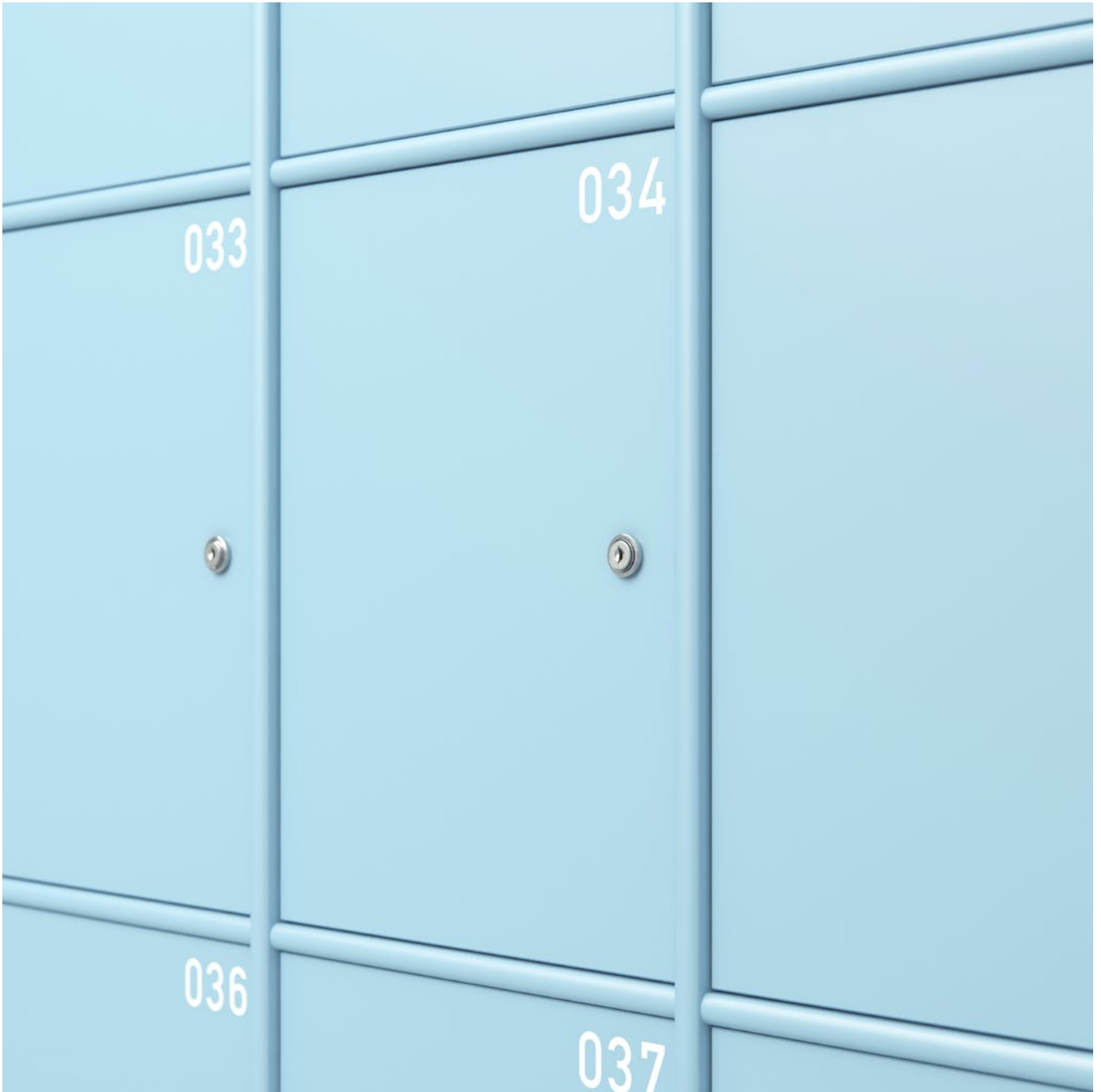
Locker with keylock and numbers Colour: Peppermint